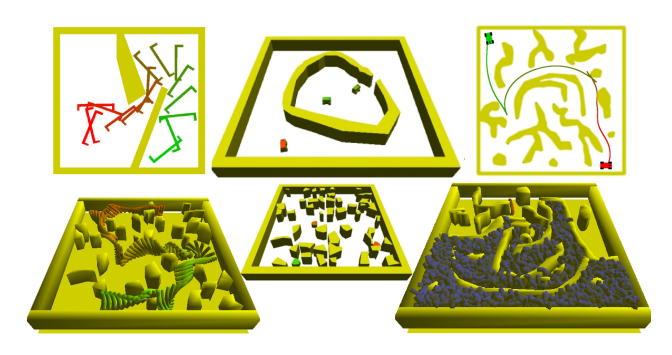
Figure 2: Screenshots of the graphical version of OOPSMP.

OOPSMP implements motion planners in a modular, and objected-oriented fashion. This is done in a plug-and-play fashion: users can easily create new components as plugins and have their functionality immediately available at runtime without having to recompile any part of OOPSMP. Table 1 gives an overview of the common components of a motion planning algorithm and which options are available for each component in OOPSMP. Each motion-planning component (data structures and low-level algorithms) can be combined and plugged into each motion planner giving rise to a combinatorially large number of possibilities. This provides a great degree of flexibility in evaluating the impact of different components and comparing different motion planners.